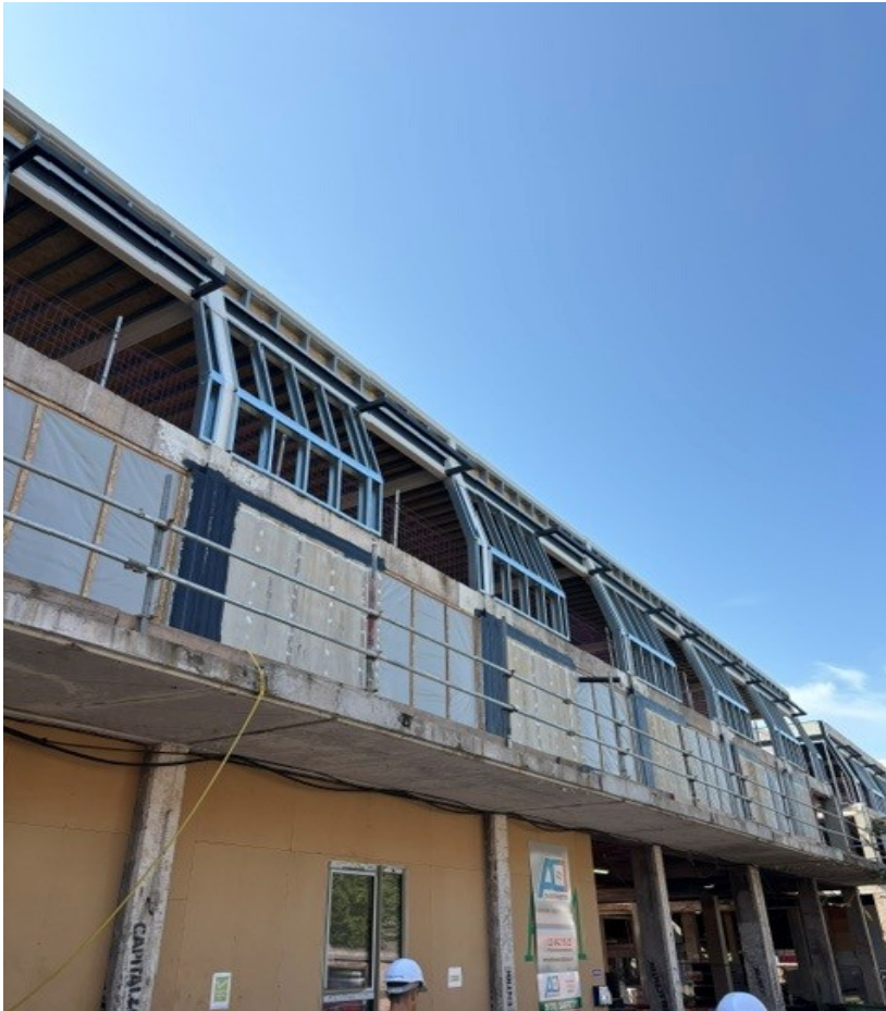
Merriel Street Elevation – external facade works

Works are ongoing with external facade works, internal courtyard landscaping and internal wall placements progressing at speed.