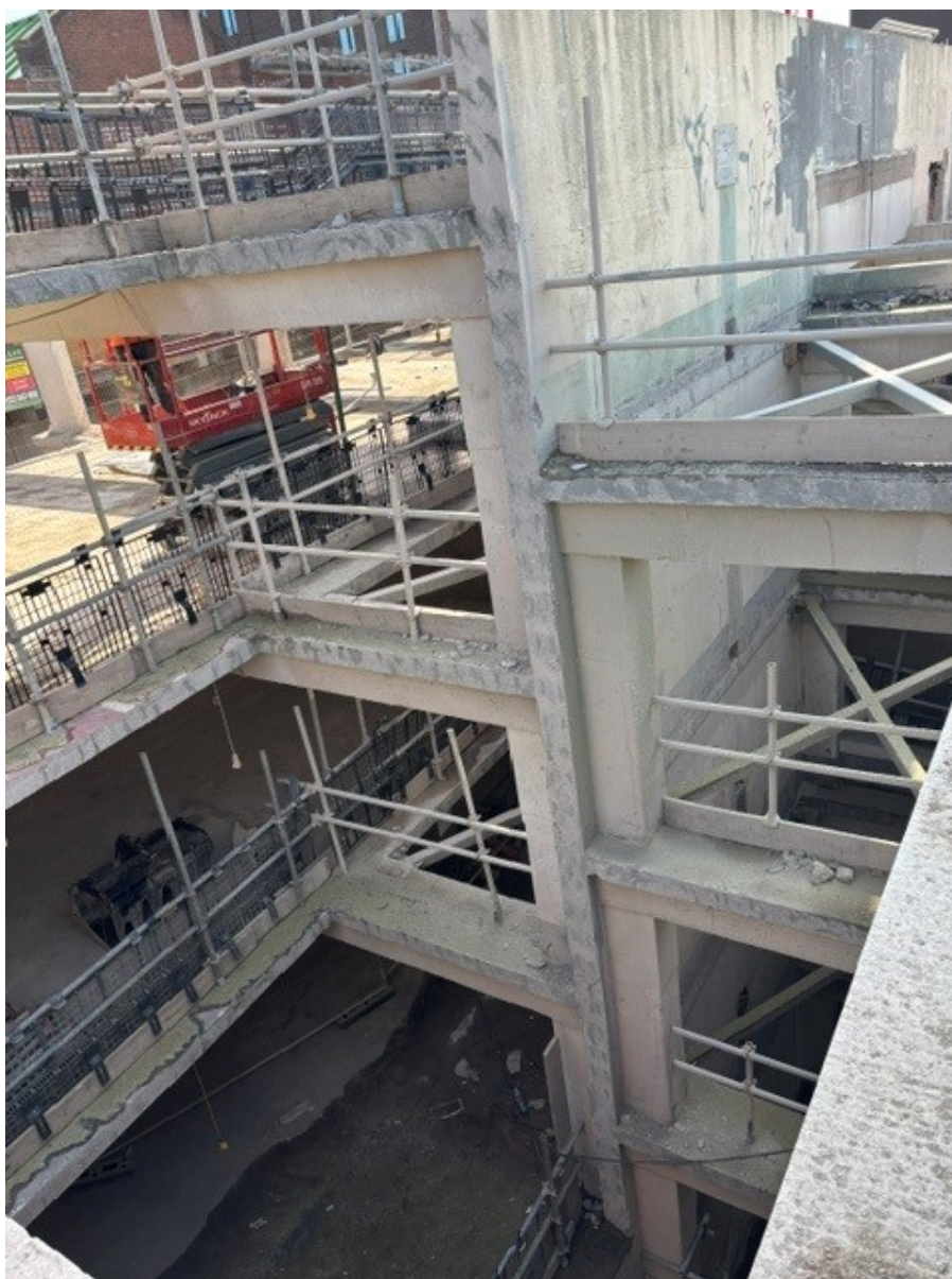
New Atrium along central spine of the development to create 'lightwell'