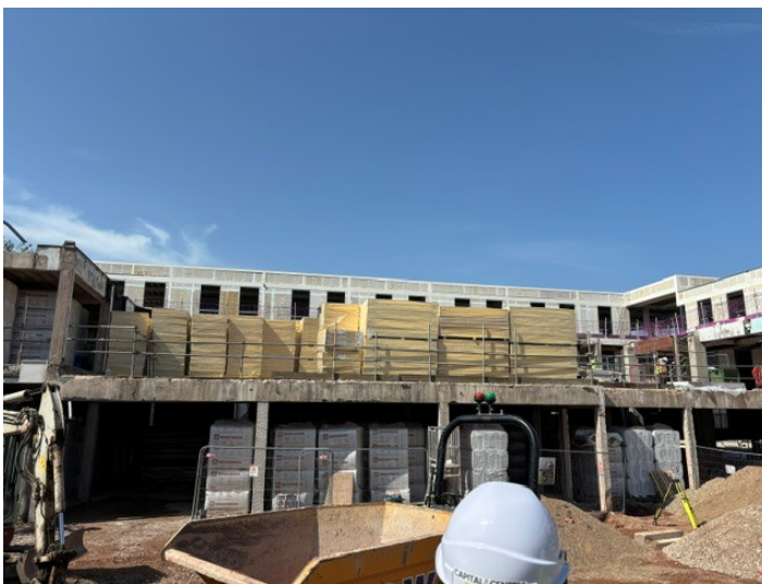
Internal Courtyard – levelling of area for landscaping