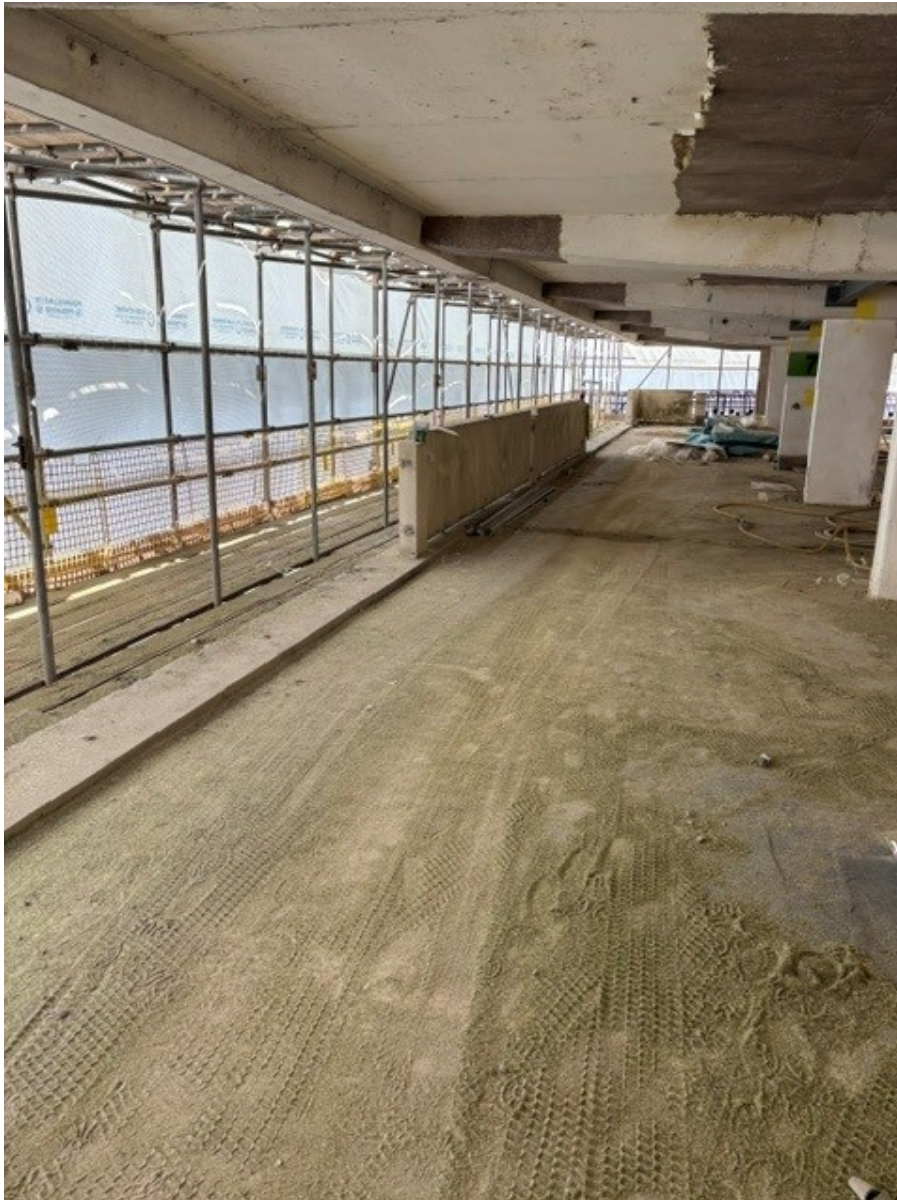
New Balustrade punch outs for apartment balcony