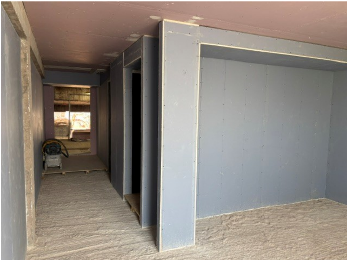
Internal wall fit out for apartments