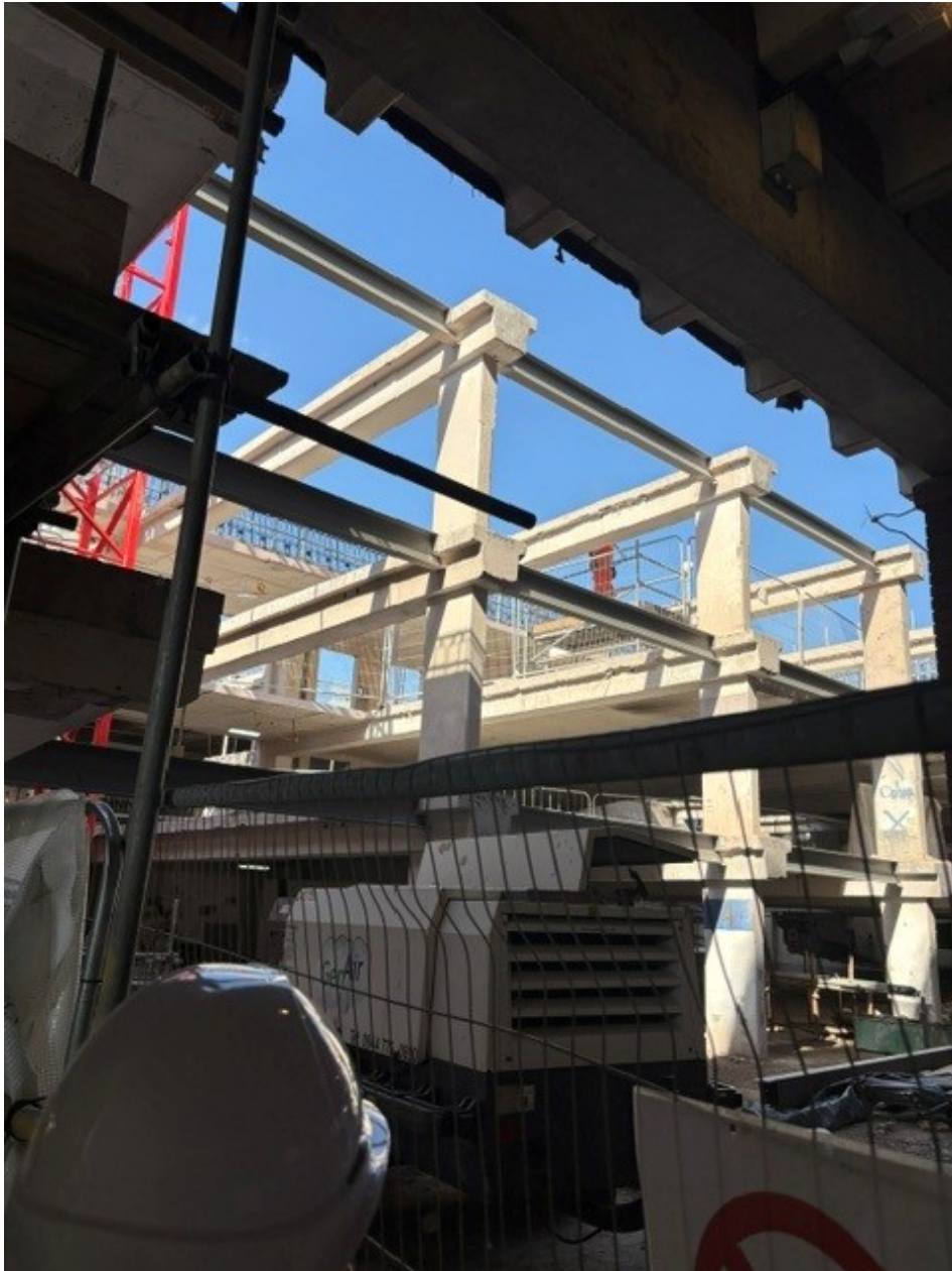
New Entrance created at undercroft with Boots / Roebuck