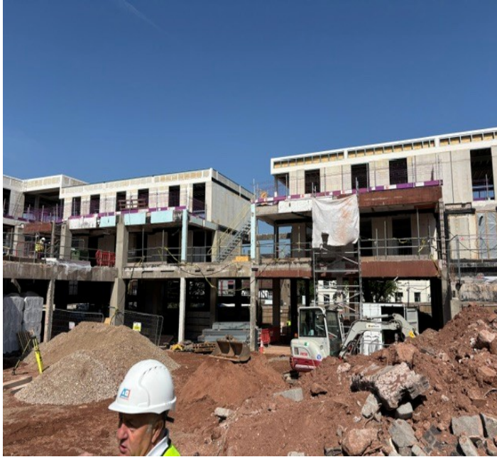
Internal Courtyard Area and internal facing elevations