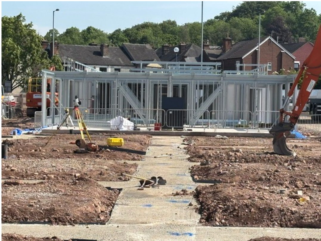
Central Apartment Block framing and foundations underway