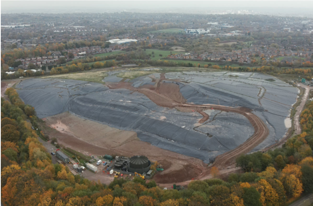
Aerial view of Walleys Quarry - 6 November 2025