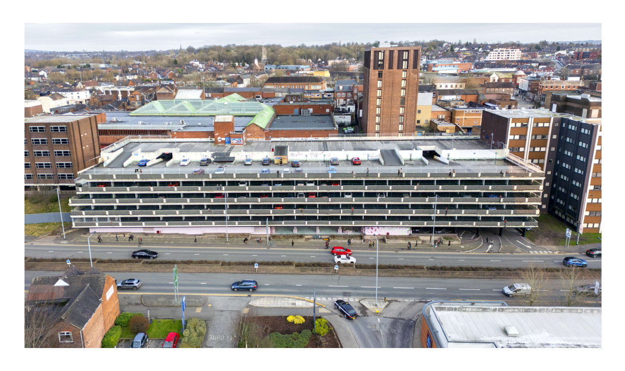
Appendix 1- CGIs and sketch images