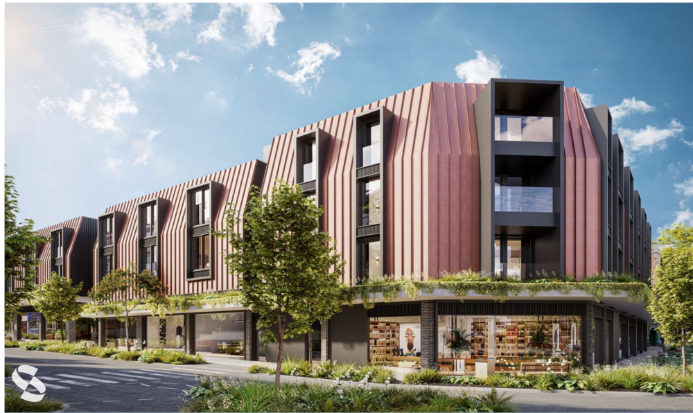
Merrial Street / Red Lion Square

Part of the new square created within the development will be a new small scale music venue which will be supported by Joules Brewery and a newly created CIC, with the aim of hiring out the facility for new and upcoming music acts, exercise classes, performance activities and art-based functions.