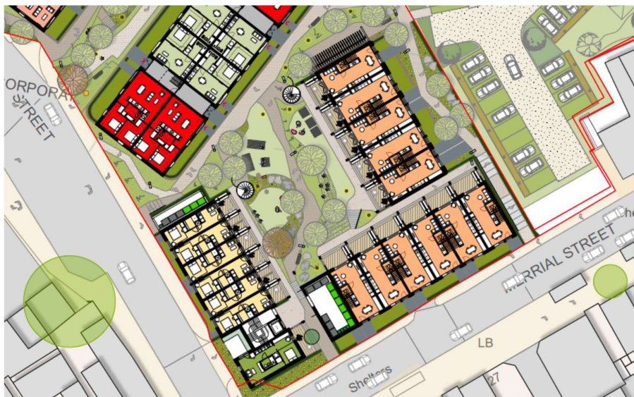
Aparthotel and apartment layout along Merriel St

Capital and Centric's planning application for the whole of the wider Ryecroft development submission is currently out for consultation and will be considered at a planning committee in early Spring.