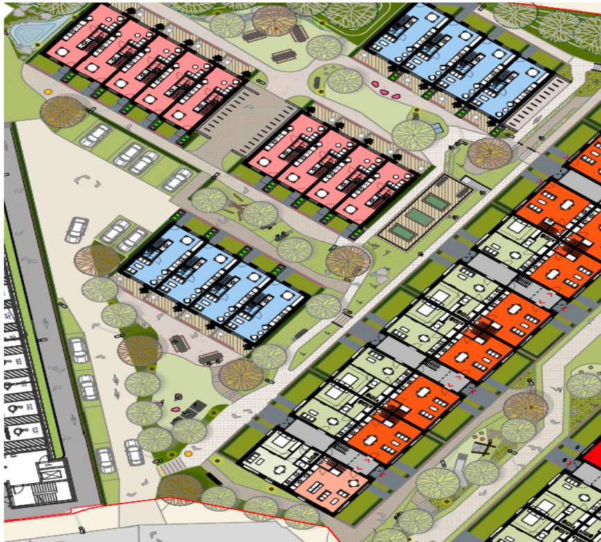
Aspire Residential Development